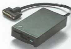
External diskette drive