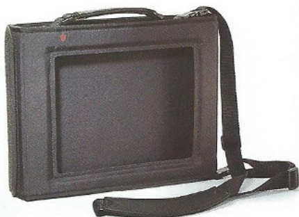
Standard carrying case (included with 700T)